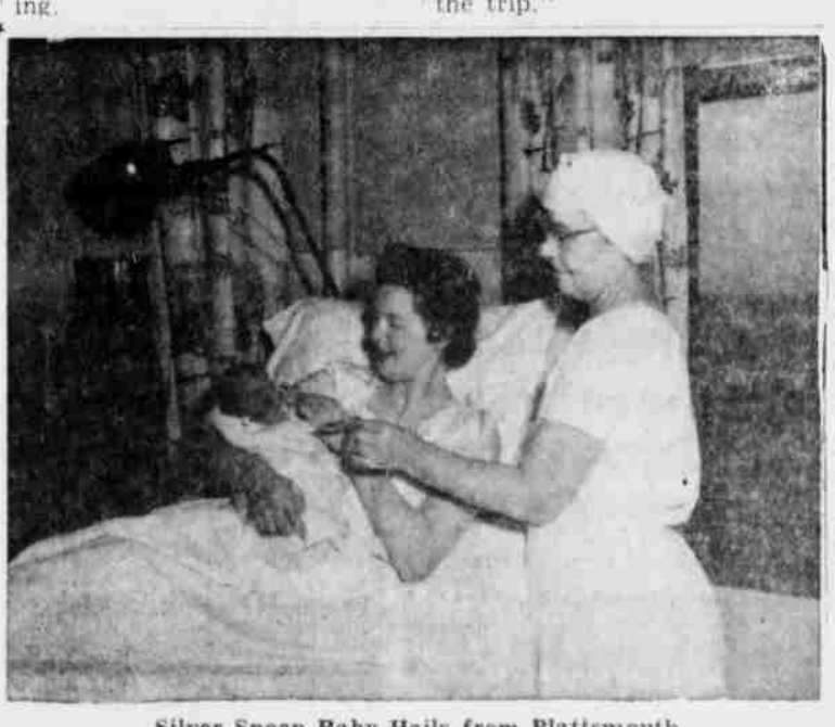
Silver Spoon Baby Hails from Plattsmouth

"We had planned a trip to the mountains in this Maxwell, but I don't remember that we made the trip."