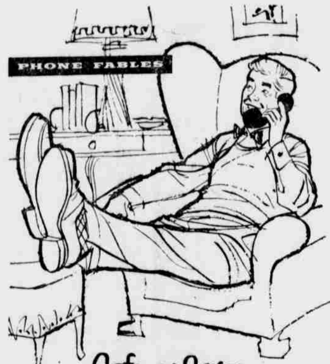
Safe or Sorry

"I'll call early this Christmas," said Izzy. And he phoned when the circuits weren't busy. His calls went right through. Helped the operator, too. Old Izzy's not so dizzy, now is he?