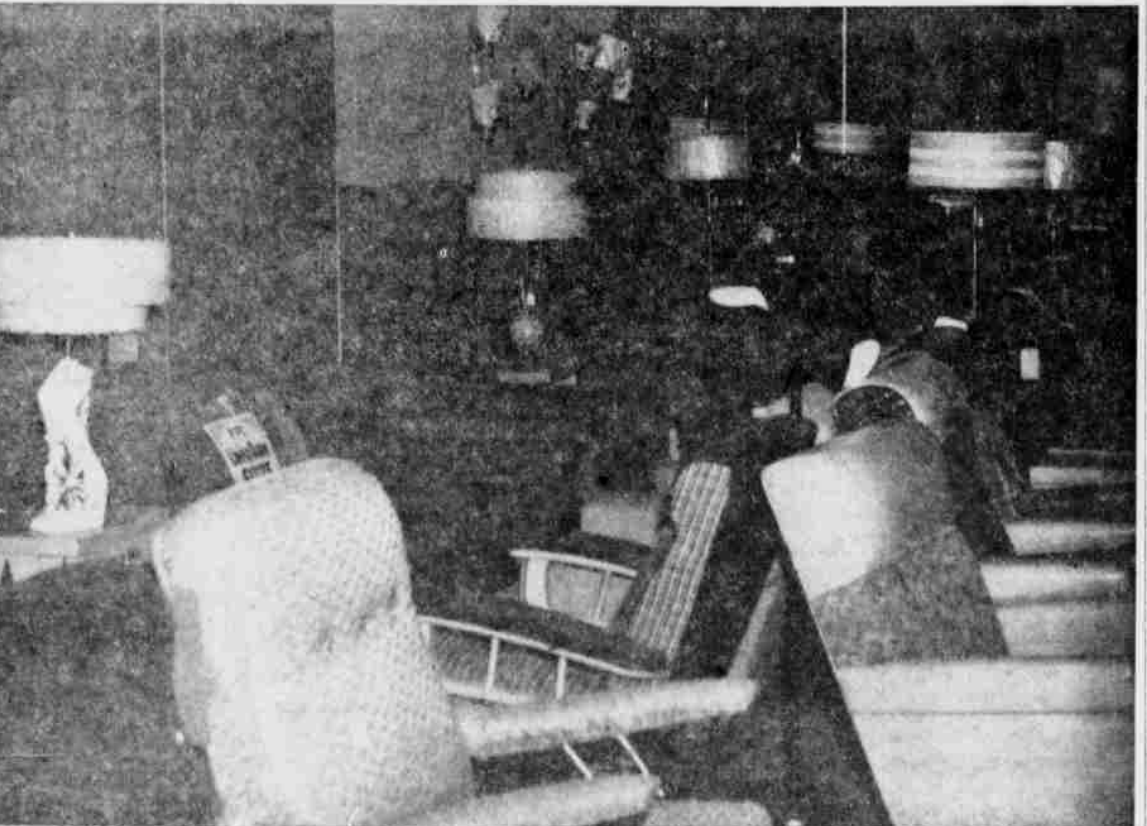
It took a long time and a lot of doing but Herb Freeburg finally got the basement of his store finished. Here you see the new furniture department. Lack of space gave the display of furniture on the main floor a crowded look. This has been eliminated in the basement display room.