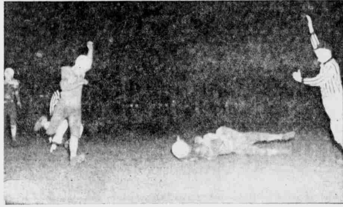
THERE THEY ARE! — The official and player in left foreground have hands raised high as if to signal to the rest of those at the Homecoming football game Friday night that they'd found the scene of action. There was rain,

Plattsmouth and Auburn High schools labored under the most appalling conditions to provide a good Homecoming football game here Friday night.