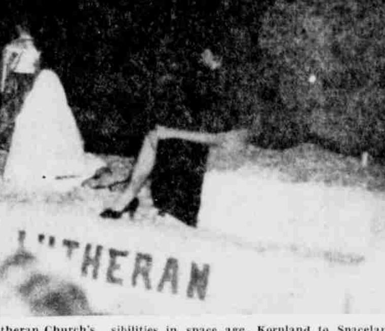
CHURCH FLOAT—First Lutheran Church's float in the Friday night parade focused serious thought on the way the world meets responsibilities in space age. Kornland to Spaceland was the Karnival theme.