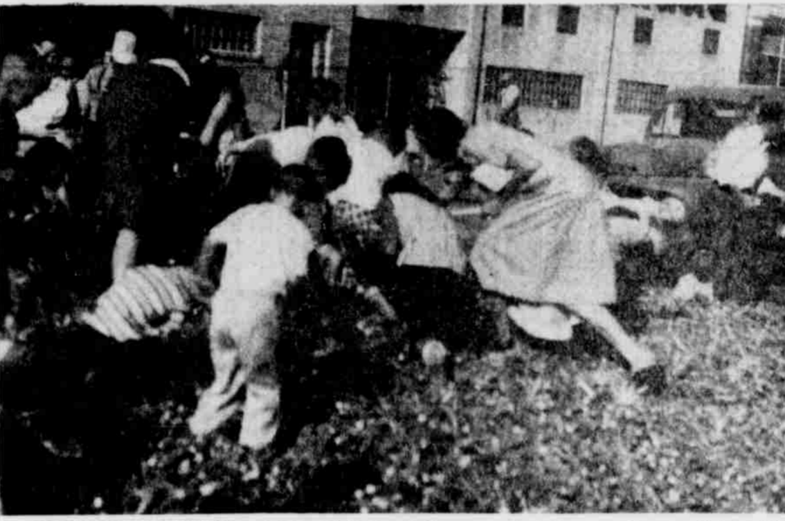
OH WHERE, OH WHERE — Four and five-year-olds searched for prizes in the corn pile and mummies searched for four and five-year-olds Friday as part of the annual corn cob scramble. No one was lost permanently.