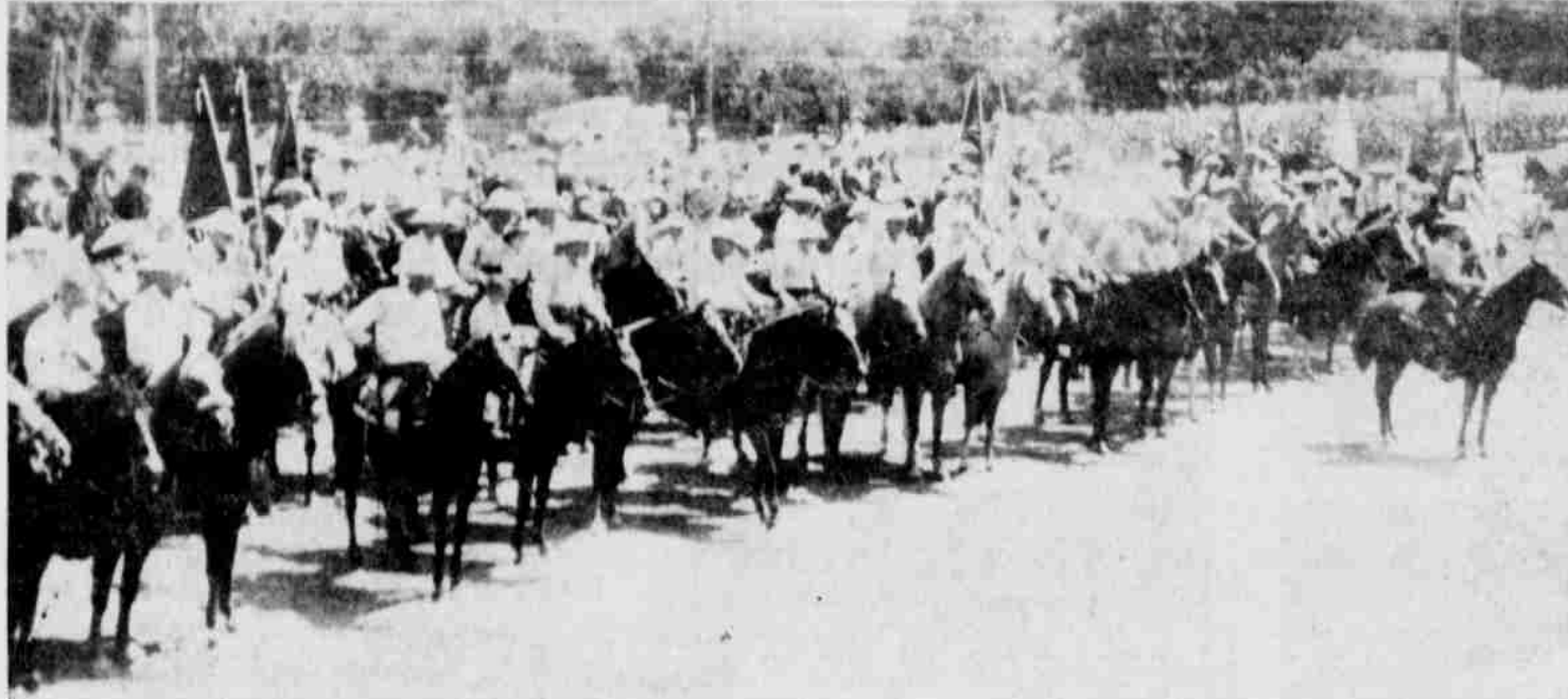
GRAND ENTRY — Some of the better horseflesh in these parts is shown above just as the entries in the Cass County Saddle Club's show here Sunday had entered the Plattsmouth Sale Barn