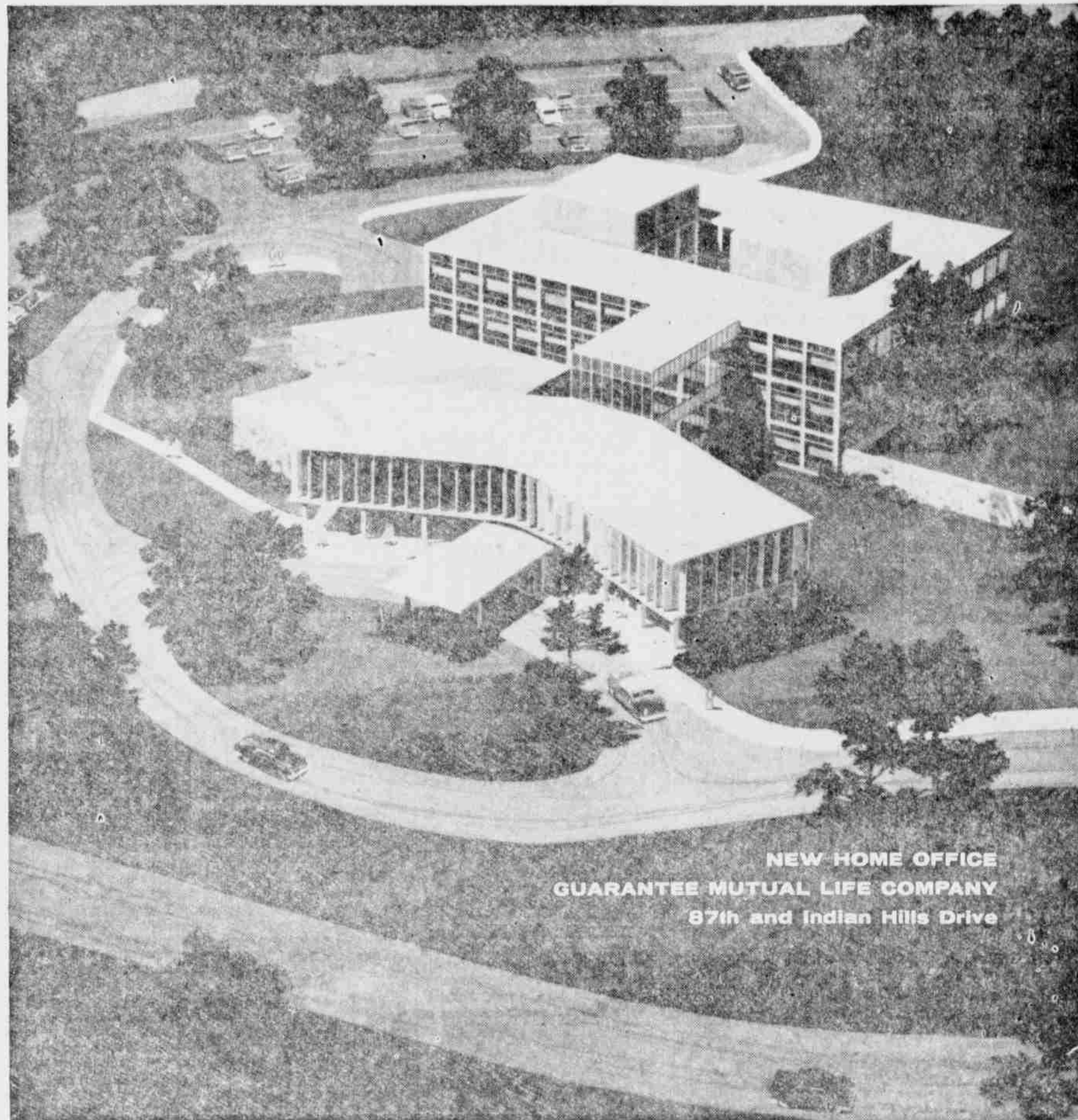
NEW HOME OFFICE GUARANTEE MUTUAL LIFE COMPANY 87th and Indian Hills Drive