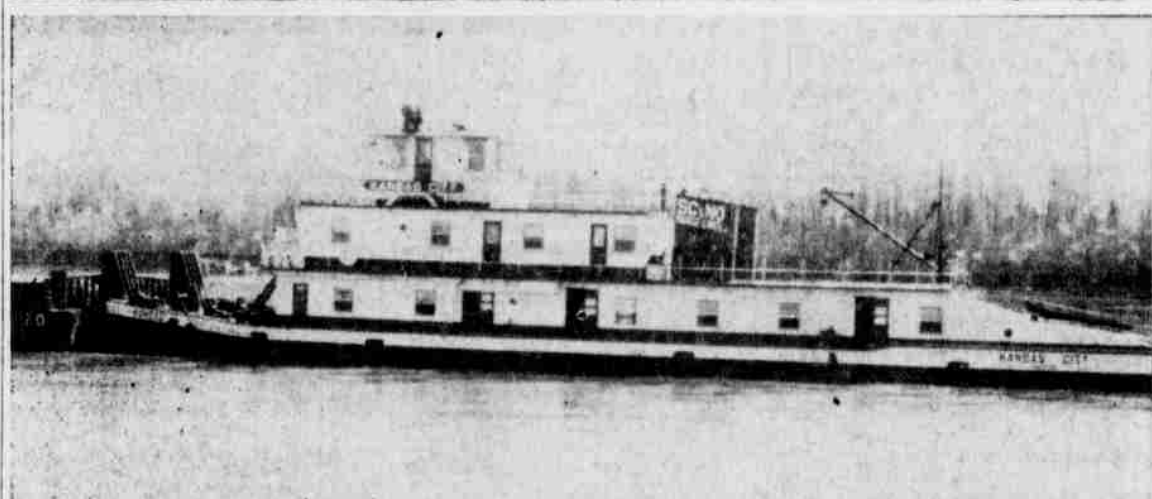
ALLIED BARGE DELIVERED — The foremost barge in the top photo was delivered to the new river dock area here Thursday by the river tow boat Kansas City, shown broadside in the lower picture. The other two barges contained 900 and 700 tons of steel for Omaha. Allied Chemical of La Platte loaded its second barge of the season with liquid nitrogen.