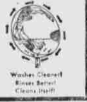
Washes Cleanest - Rinsees Best - Cleans Safely

WESTINGHOUSE DELUXE ELECTRIC SPEED DRYER