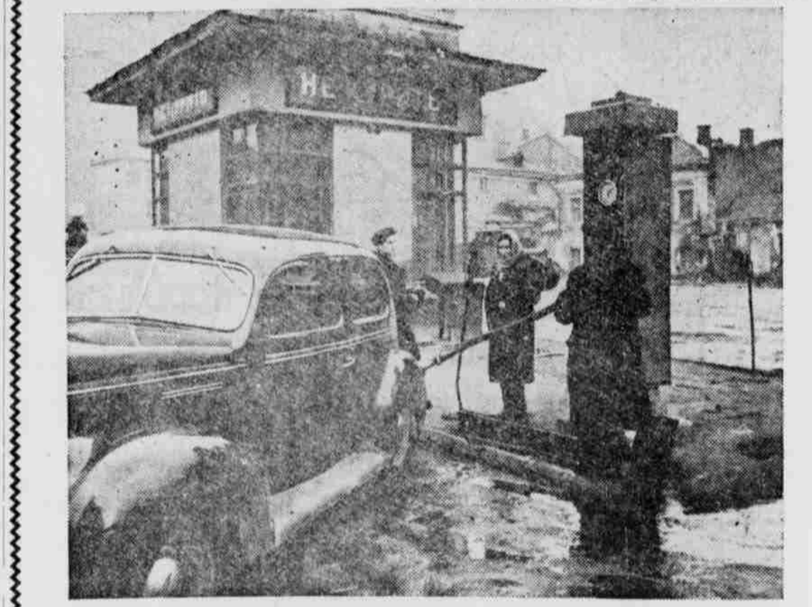
Unretouched photograph of one of Moscow's 5 "service" stations