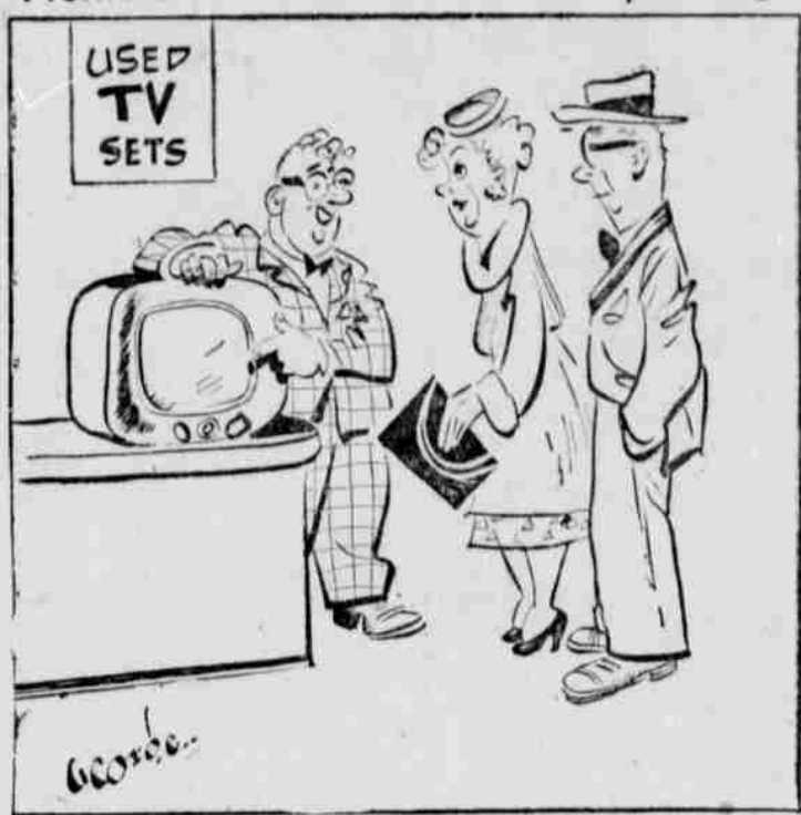
"Here's the best buy in the store. The former owner worked nights and slept all day."