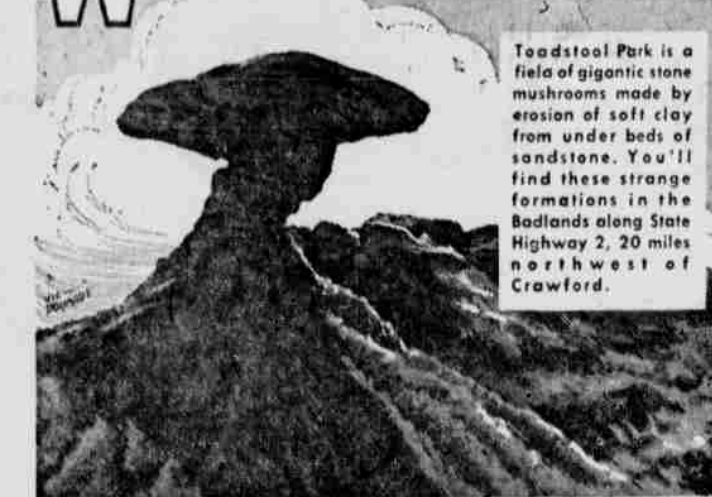
Toadstool Park is a field of gigantic stone mushrooms made by erosion of soft clay from under beds of sandstone. You'll find these strange formations along State Highway 2, 20 miles northwest of Crawford.

Beer Belongs...in good company at home or away. Its friendly sparkle...its downright good taste, make beer Nebraska's favorite beverage of moderation. NEBRASKA DIVISION United States Brewers Foundation 710 First Nat'l Bank Bldg., Lincoln