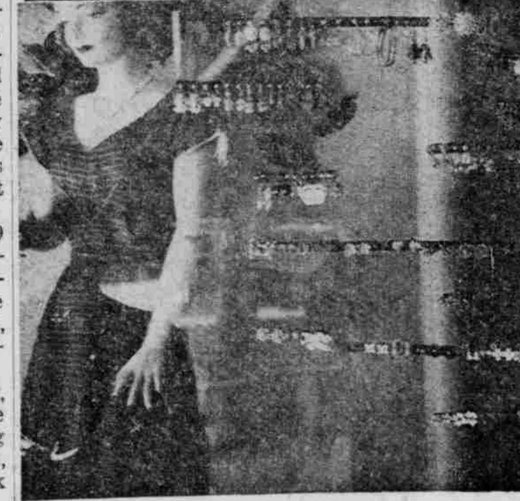
The Ears Have It!