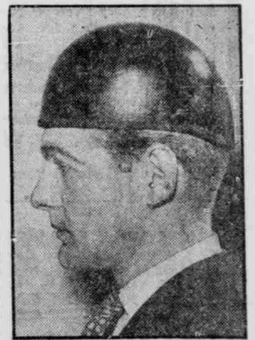
HORSE SENSE —British model sports the latest thing to wear at the track—if you're a jockey. It's a crash helmet, designed for wear under the traditional jockey's cap. Fashioned of layers of shellacked cotton, it's designed to minimize head injuries resulting from spills.

India and the United States have signed a food and loan agreement that will give a major stimulus to the Indians' economic development plan.