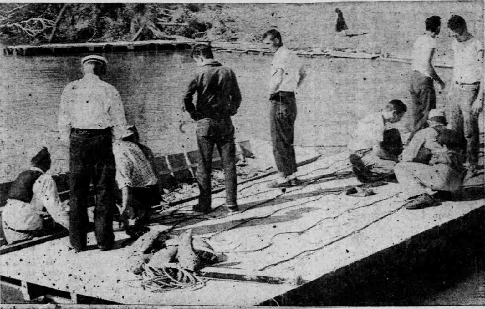
8:30 A. M. - BOAT CREWS and volunteer line used to drag river bottom, today at St. Mary's Episcopal workers start task of preparing hooks to 150-foot

She has many friends in the old home that will regret to learn of her passing. Burial will be at Mt. Cavalry cemetery at Los Angeles.