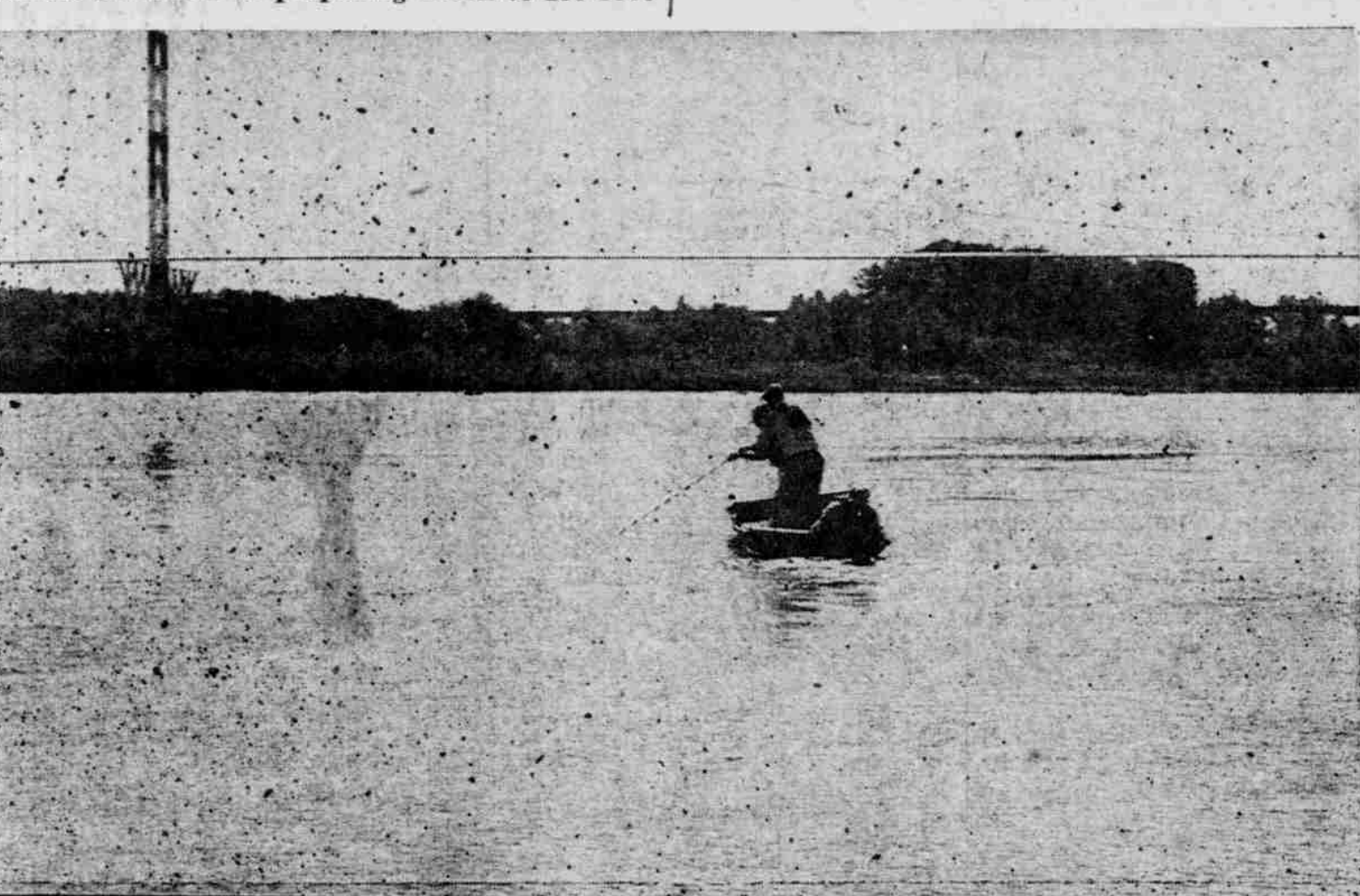
10:15 A. M.—SOLOMON, Hamlin and McGraw | start bringing in the line from 40-feet of water near main current of river.