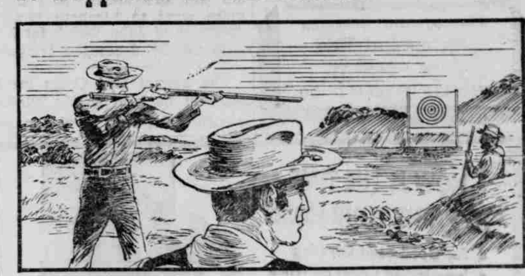
In 1819, when an army private's pay was about $6 per month, the companies at Fort Atkinson conducted daily target practice. If a soldier could place four shots out of six within three inches of the target's center at 100 yards-shooting offhand -he was considered a good shot. That WAS shooting!