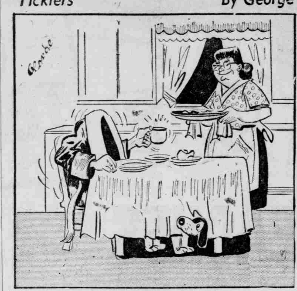
"Lose your head at the party?"