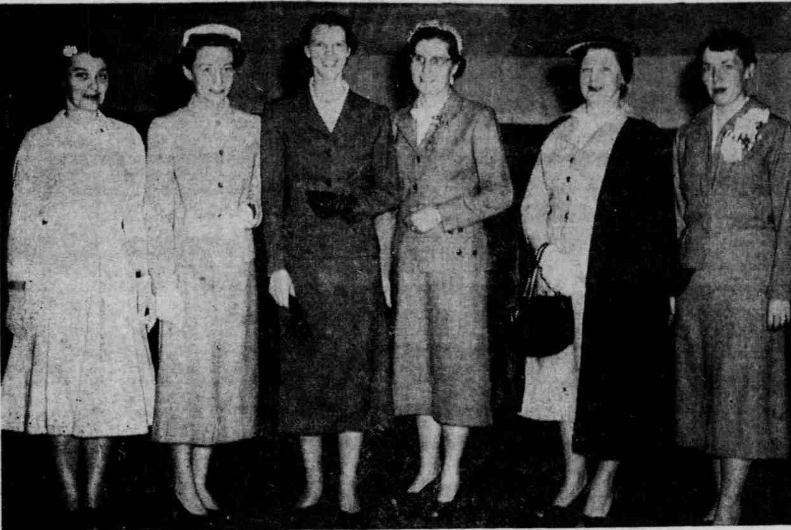
DO IT YOURSELF and pocket the savings appeared to be the motto of the Plattsmouth adult homemaking class who sewed up these clothes and modeled them in a style show at the high school auditorium last week. From the