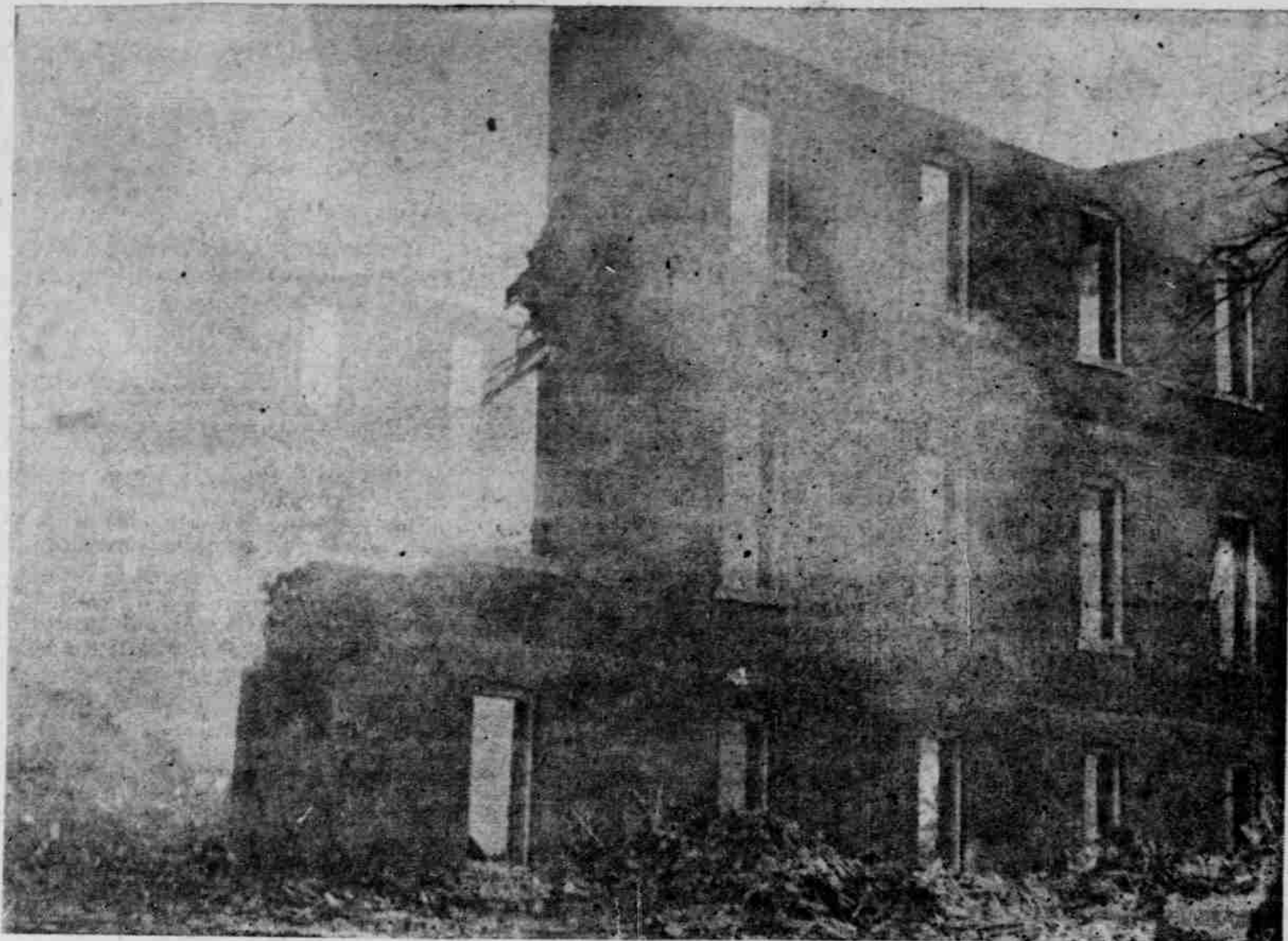
FIRE WAS one way to get rid of the rubble which collected inside the bare walls of this building being torn down at the Nebraska Masonic Home at Plattsmouth. Razers have now removed the insides of the three buildings which long served the home, and all that remained standing last week were part of the walls and lots of rubble.