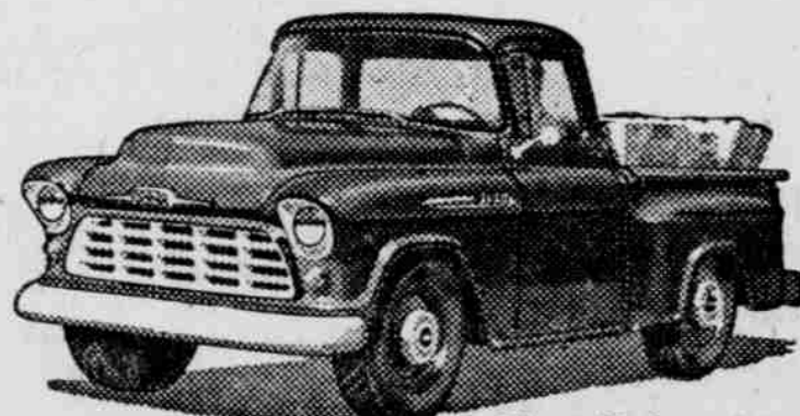
New Lightweight Champs

New models to do bigger jobs—rated up to 32,000 lbs. G.V.W.! New power right across the board—with a brand-new big V8 for high-tonnage hauling! New automatic and 5-speed transmissions!