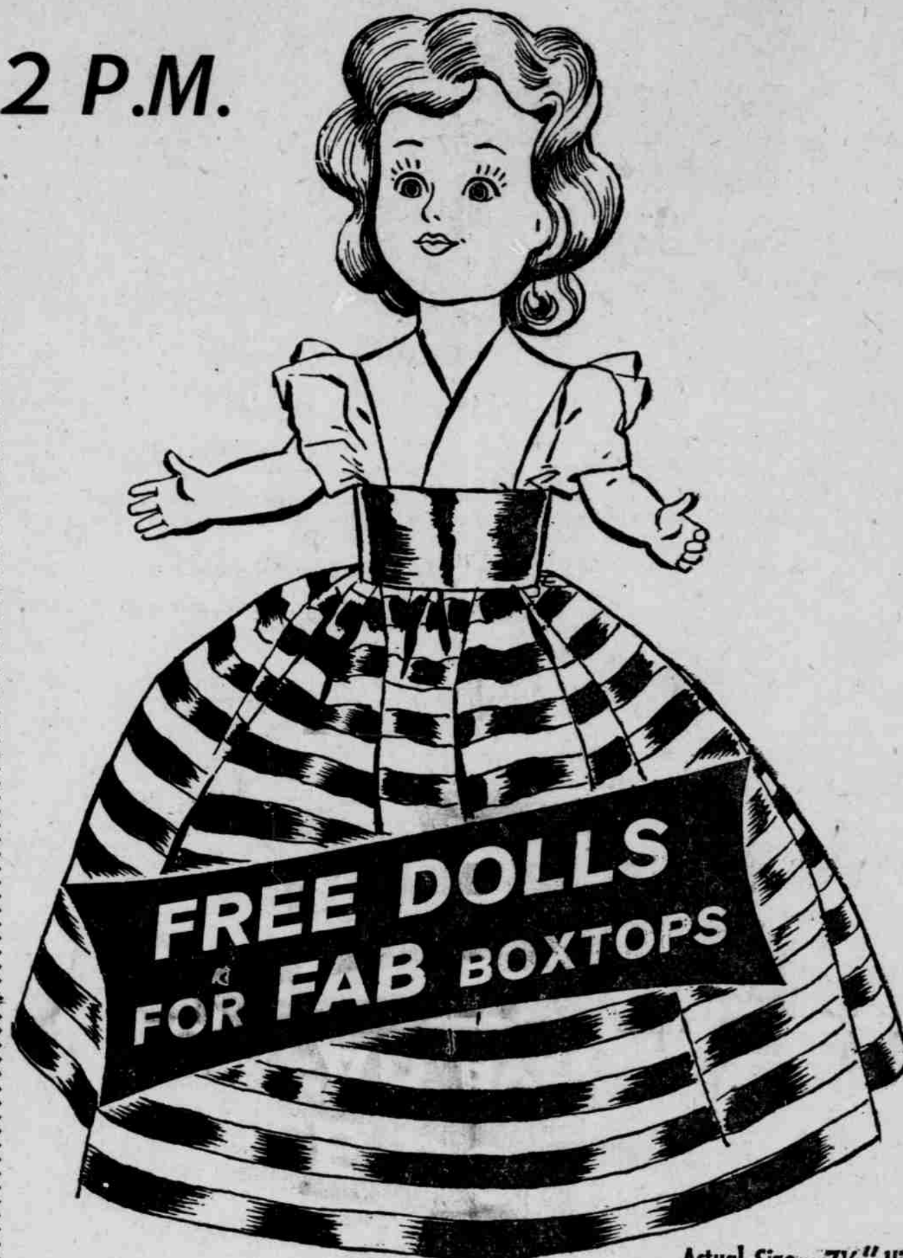
Actual Size—7 1/2" High

This Doll FREE For Fab Box Top Boxtops Will Be Turned Over to Plattsmouth Salvation Army