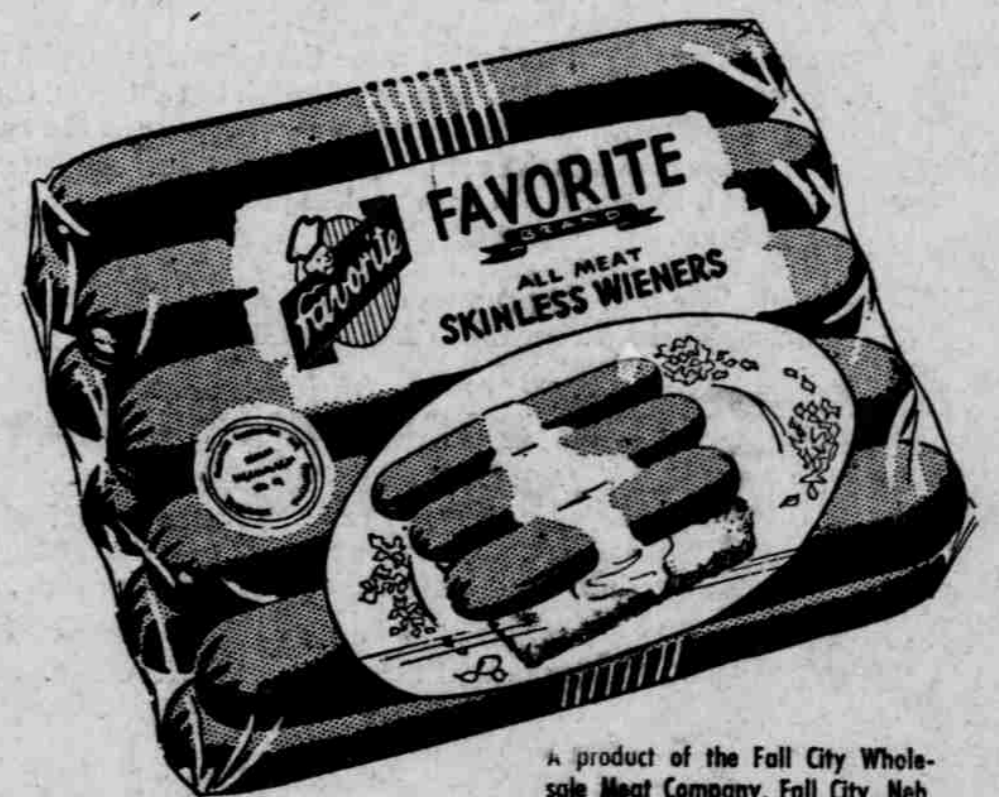
A product of the Full City Wholesale Meat Company, Full City, Neb.

Everybody's favorite because they have that "built-in" outdoor flavor . . . the result of careful hickory smoking. Plump, tasty and all-meat, "FAVORITE" is a winner of a wiener! Featured by leading grocers.