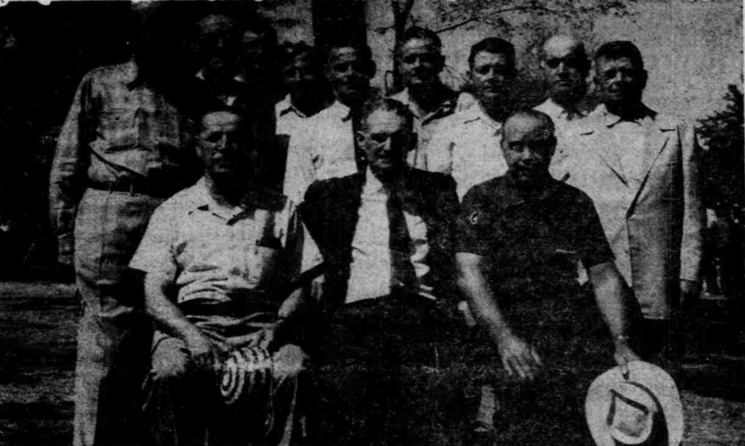
Burlington shop employees at Plattsmouth held a picnic at Garfield Park in Plattsmouth last Sunday. Lining up here for a photo were the BREX supervisors, seated, from left: G. J.