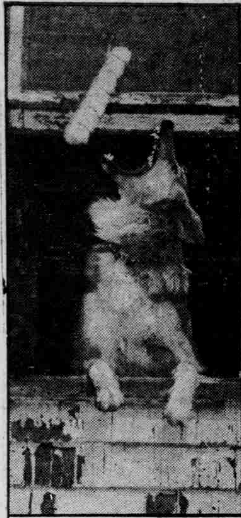
GOT IT! —"Rusty," pet collie of Long Island Railroad's signal-tower operator at Locust Valley, N.Y., catches paper for her master tossed off by conductor of a passing train.