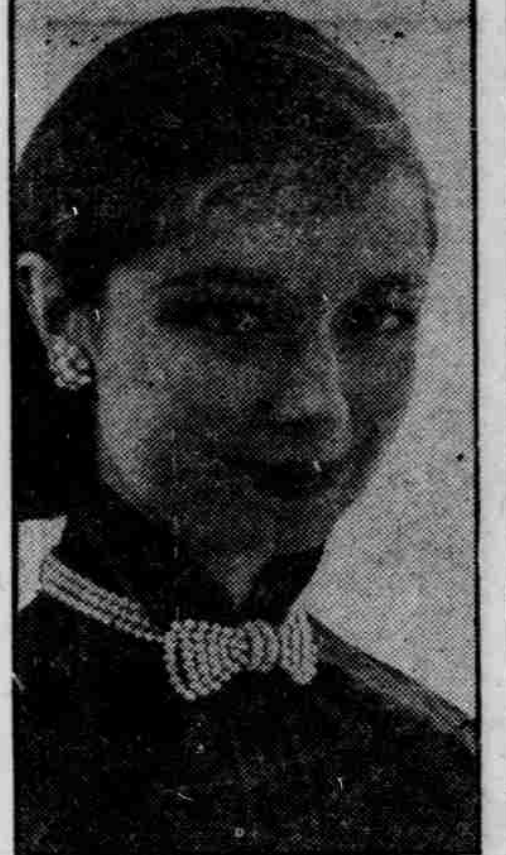
TIE THIS—Simulated pearls, "tied" with rhinestones, set off wool and flannel shirtwaists for Fashion's fall wardrobe. Button-cluster earrings complete the costume ensemble.