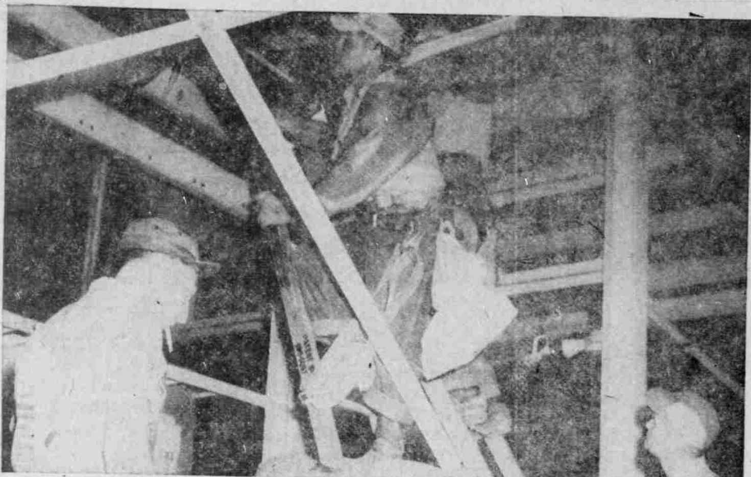
Consumers construction crew members from Lincoln area plant start job of removing burned out cable at sub-station about 11:00 Monday

night. Some 30 men arrived in six trucks to do a job that took them until three o'clock Tuesday afternoon to complete.