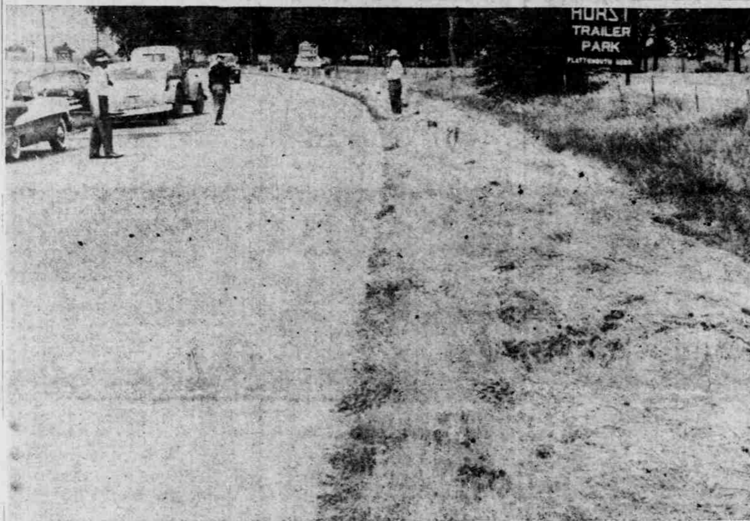
Two Nebraska City people are in St. Mary's hospital after a car in which they were riding went out of control two miles south of Plattsmouth on Highway 73-75 Friday afternoon, sheared off three guard rail posts, bounced off and rolled over on its top across the highway. They were Mr. and Mrs. William Rambat who were going around a sweeping curve when the car went out of control. Mrs. Rambat, 77, had two broken legs; Mr. Rambat, 81, suffered head injuries, bruises and a back injury. Upper photo shows vehicle back on its wheels as tow truck hooks on. Lower photo shows guard rails broken off and bent by impact.—(Journal Photo).