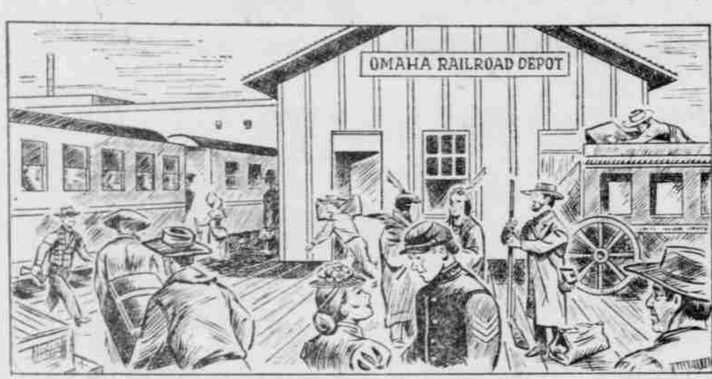
Nebraska's first railway depot was perhaps as much a sight-seeing point as it was a take-off point for trains. Indians, buckskin-clad plainsmen, farmers, gamblers, businessmen, ladies-ALL could be seen daily at Omaha's first depot in 1868.

In pioneer days, Nebraska's taverns were colorful, too (too much so!). But times have changed. Today our taverns are quiet, respectable businesses which have, in recent years, earned the good will of all. 710 First Nat'l Bank Bldg., Lincoln