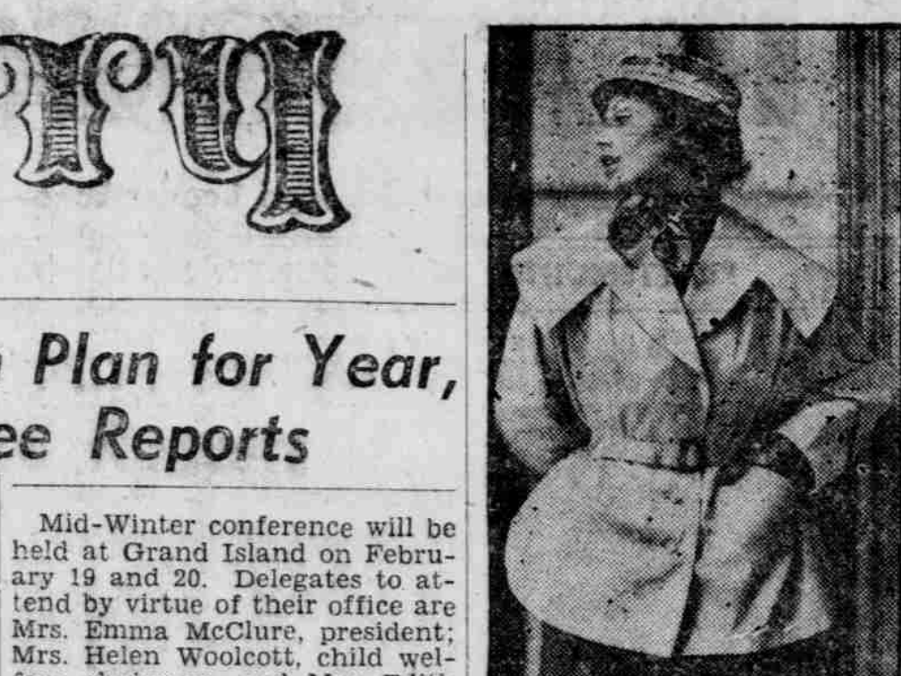
BRIEF PROTECTION -- Scooter coat, adapted from sports-car wear, is finger-tip length and weatherproof. Styled in bright yellow poplin, it has a deep shawl collar, pearl buttons and is lined in rainbow plaid. Being shown in New York City, it may be worn with or without the belt.

Subscribe to The Journal NOW! rubber plant sales pacts