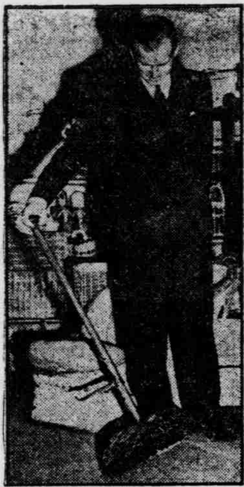
BRUSH WITH ROYALTY —How to acquire the polished look that's fit for a queen is demonstrated by Queen Elizabeth's husband, the Duke of Edinburgh, as he visits a display in London of products made by ex-servicemen. Note boot-and-shoe scraper on side of shoebrush handle.

JIZBA & JIZBA Registered in Engineering and Architecture Design, Surveys, Estimates, Supervising 5417 Ogden Omaha, Nebr. Phone PL6361