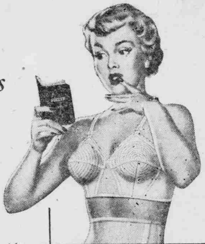
#566, new Life "Romance" bra in dainty cotton tulle. Exclusive nylon-braid inner stitching for a lovelier, more lasting lift. Washes beautifully. 32A to 38C. $2.00