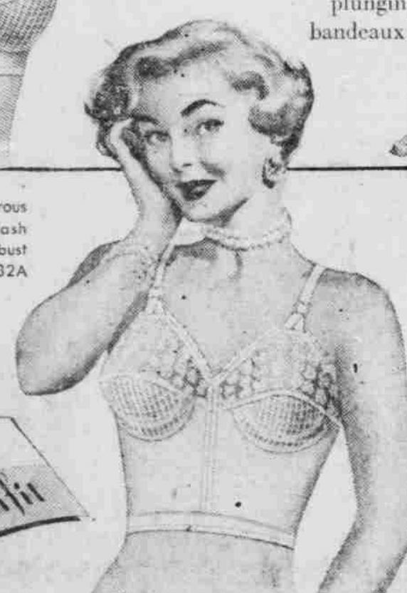
Life in Formfit