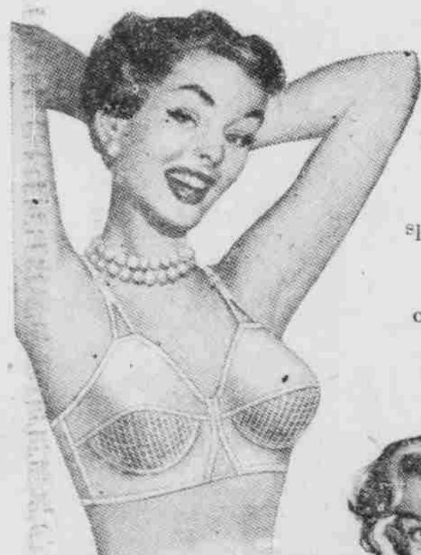
#574, above. Glamorous nylon taffeta with slash front. Stitched underbust for flattering uplift. 32A to 38C. $2.50

No wonder Life Bras give you the right beauty-answer for whatever your figure type... because there are styles for all occasions, all types of bust contours. Some with a special talent for dividing: some with a gift for padding figures that's absolutely detection-proof! All have a knack for upping your curves, adding allure. Best of all, Life Bras fit you to a fraction... for blissful, action-free comfort. Come in, be fitted today—stitched, plunging, strapless, longline, bandeaux and padded styles.