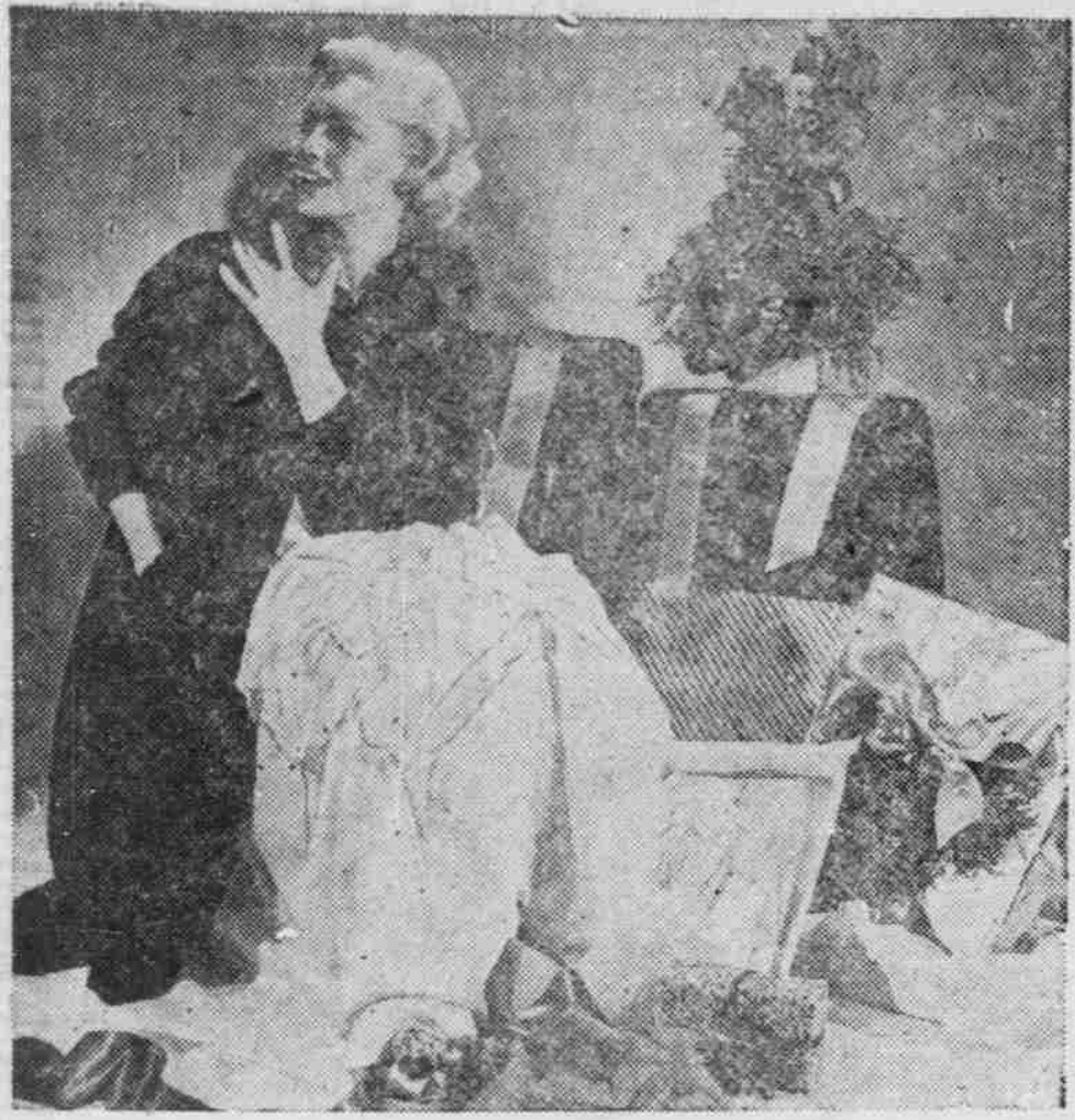
OH, WHAT A BEAUTIFUL MORNING—when the sweetest Santa gives his lady a fur coat! She loves her feminine blouse and her filmy negligee but above all, she's overwhelmed by her full-length Persian Lamb coat. Above, newly fashioned with straight lines and a sable collar, of Hammer Brand Persian.