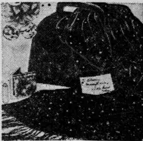
ACCESSORIES TO THE FACT OF Christmas, a satchel handbag, jeweled compact and evening stole of fringed and sequined Cheney velvet. Stole by Baar & Beards.

Sleepwear for the little dreamers range from cotton broadcloth pajamas with their own embroidered jackets to "Mambo" pajamas with ruffled sleeves and godets of ruffles at the legs.