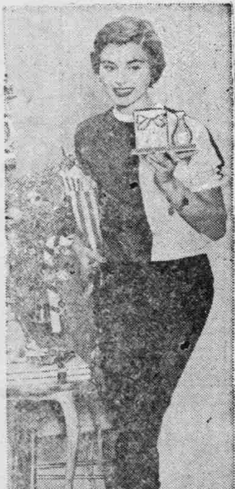
CO-EDS DELIGHT Resort cottages make exciting gifts for college girls who intend to combine their Christmas holiday with a sunny vacation.