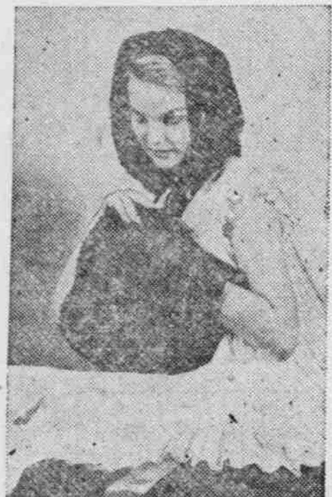
LITTLE FURS go a long way to making her happy on Christmas and ever after. Hood and pocketbook-muff of Hammer Brand Persian Lamb.