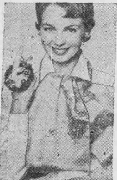
SCARF FROM SANTA reflects holiday flair. Above, snowflakes printed on taffeta with a sprinkling of pearl and rhinestone "snowflakes." By Vera.