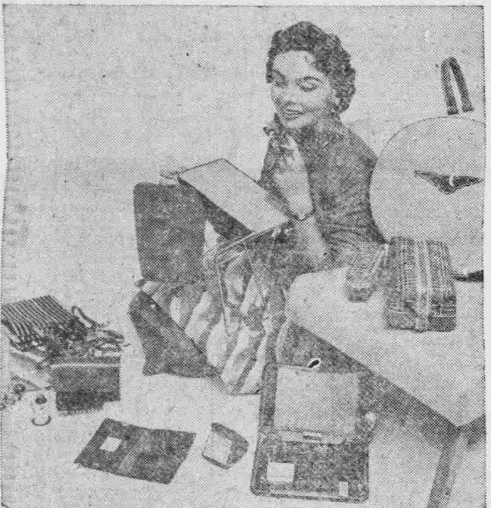
GIFTS FOR A GIRL GOING PLACES hit the spot. Suggested are a many-pocketed passport case, writing kit, traveling alarm clock, and shoe shine kit. On the chair: a matched set of grooming accessories in plaid and leather and a smart hatbox. Fold-up camp chair comes in a flat carrying case.