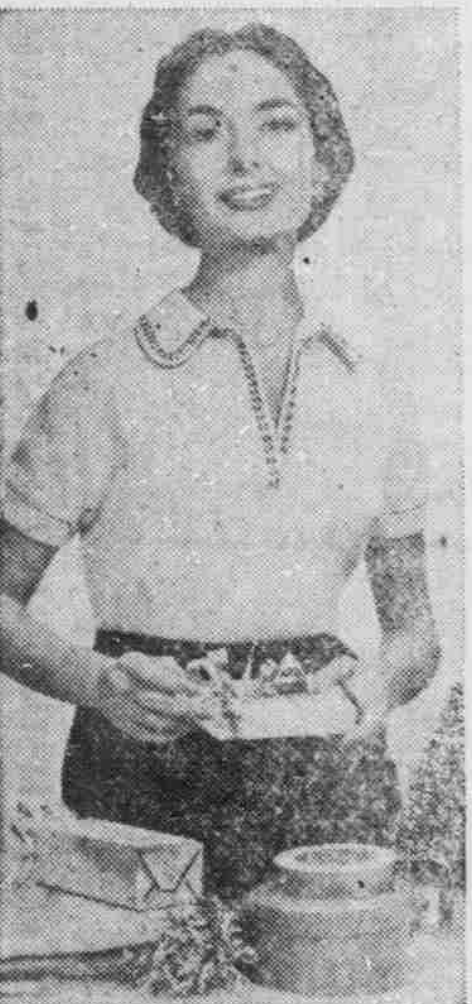
GALA GLITTER trims a gift-wise cashmere sweater. Crocheted edging is studded with rhinestones; collar buttons with a jewel. By Hadley.