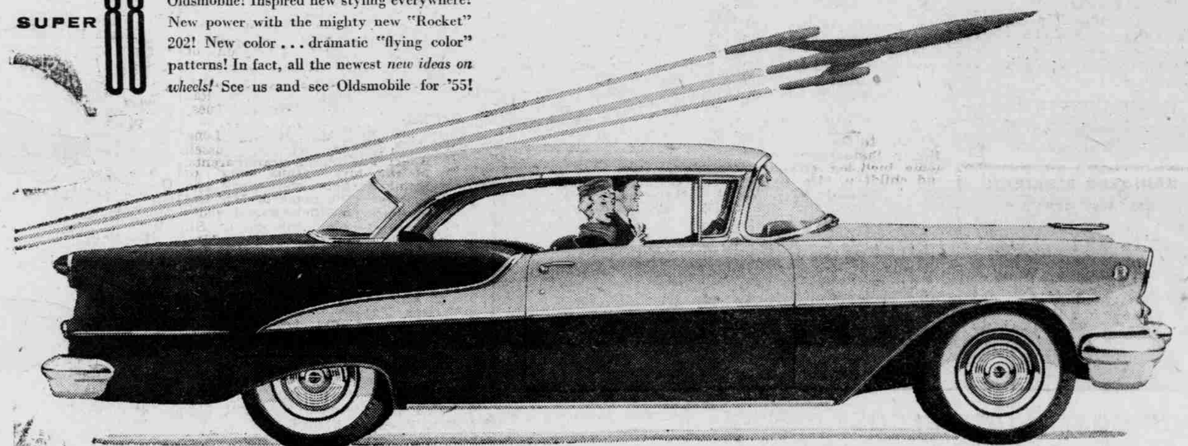
New 1955 Oldsmobile Super '88' Holiday Coupe. A General Motors Value.