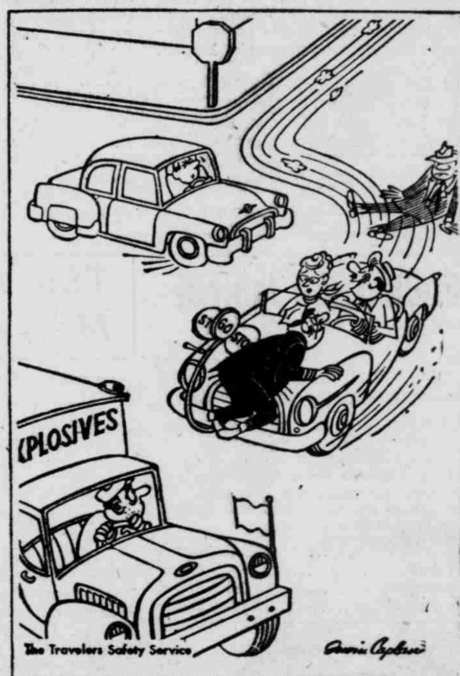
"There's still nothing wrong with the old reflexes. Notice the neat way I avoided that joker in the car back there?"

Sponsored In The Public Interest By The Following Merchants & Individuals