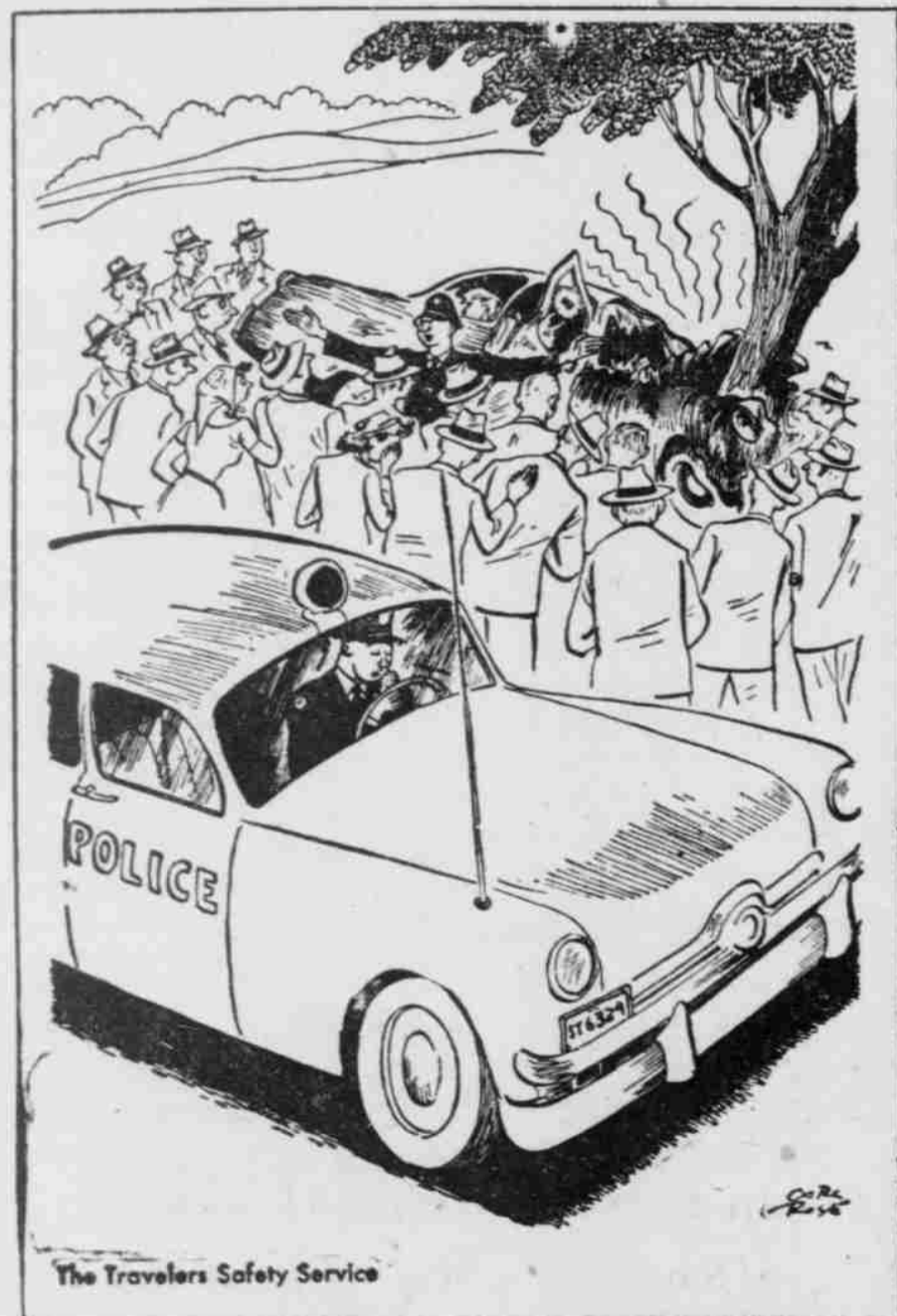
"Drunk and doing eighty. Never mind the ambulance. Send a basket."