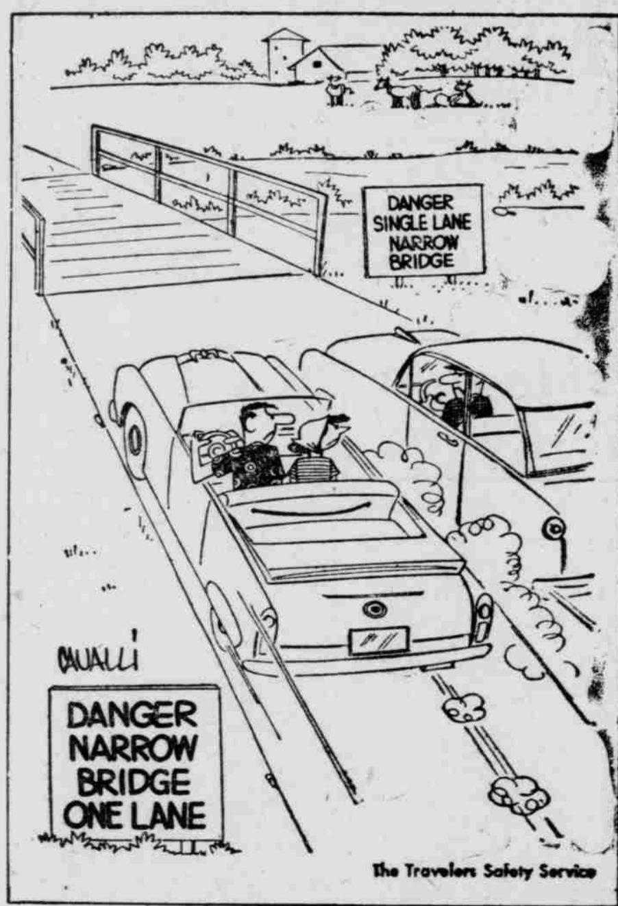
Refusal to Grant Right-of-Way Killed 2,400 in 1953.