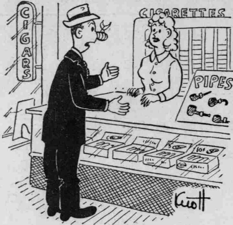
"Do you handle flameless lighters?"