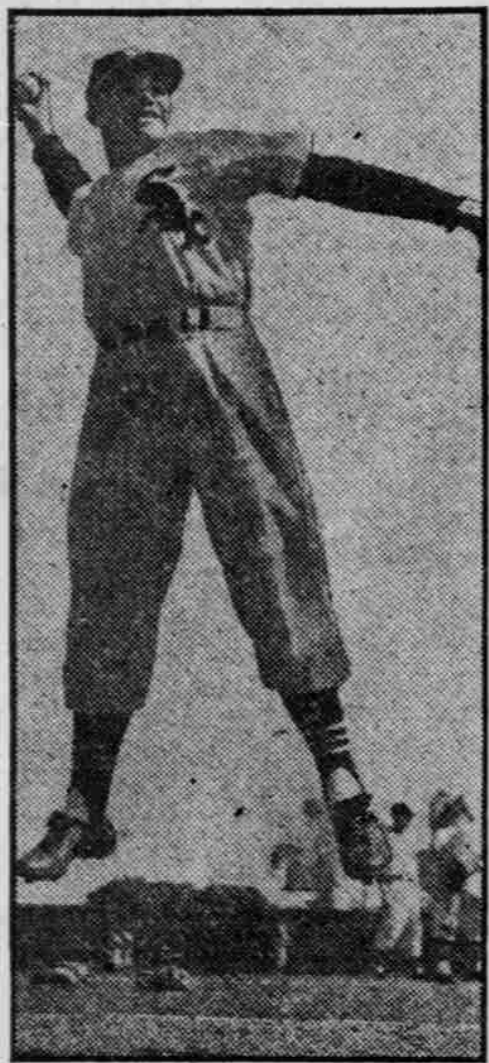
THROWING HOME — Chicago White Sox shortstop Chico Carrasquel gets well off the ground to throw home during a recent practice session. The American League team is in spring training at Camp Pale Hose, near Tampa, Fla.