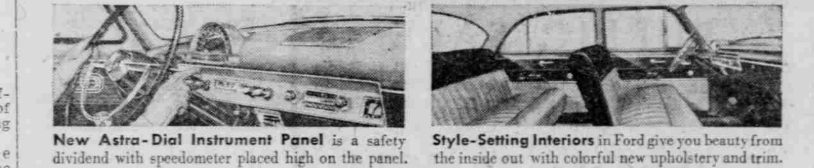
New Astra-Dial Instrument Panel is a safety dividend with speedometer placed high on the panel. Style-Setting Interiors in Ford give you beauty from the inside out with colorful new upholstery and trim.