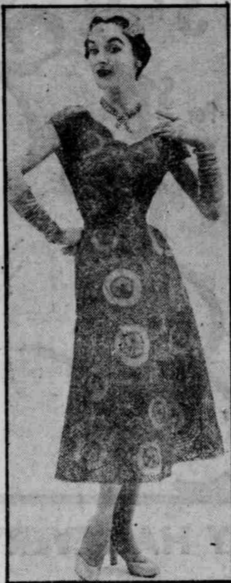
This cobwebby, hand-crocheted organza dress has various-sized medallions, flaring skirt and scalloped neckline.

For the informal wedding, there are hand-crocheted dresses in white that can be worn many seasons after the wedding.