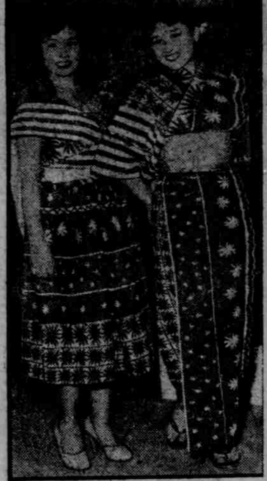
NEW NIPPON LOOK — Japanese fashions have changed since V-J day. At left is a modern adaptation of the traditional costume. Both are made of the same pattern-cloth. Note the bare shoulder and short skirt on the new-style dress. The fabric is Parisian. The place is Tokyo.

GAME LAW REFRESHER It is illegal to take a bag of game and return to hunt and take another bag the same day. Hunters are warned that persons so doing will be prosecuted and full damages of $25 per bird or animal will be assessed. Example: The pheasant limit, both bag and possession, for the coming October 24 to November 30 season is three. Hunter John Doe can shoot three birds on opening day. That is not only his daily bag limit but also his possession limit. He cannot shoot another pheasant that day. However, if he eats two birds that evening, he can shoot two more birds the next day. Though the bag limit is three, he can still only shoot two birds as he still has one in his possession.