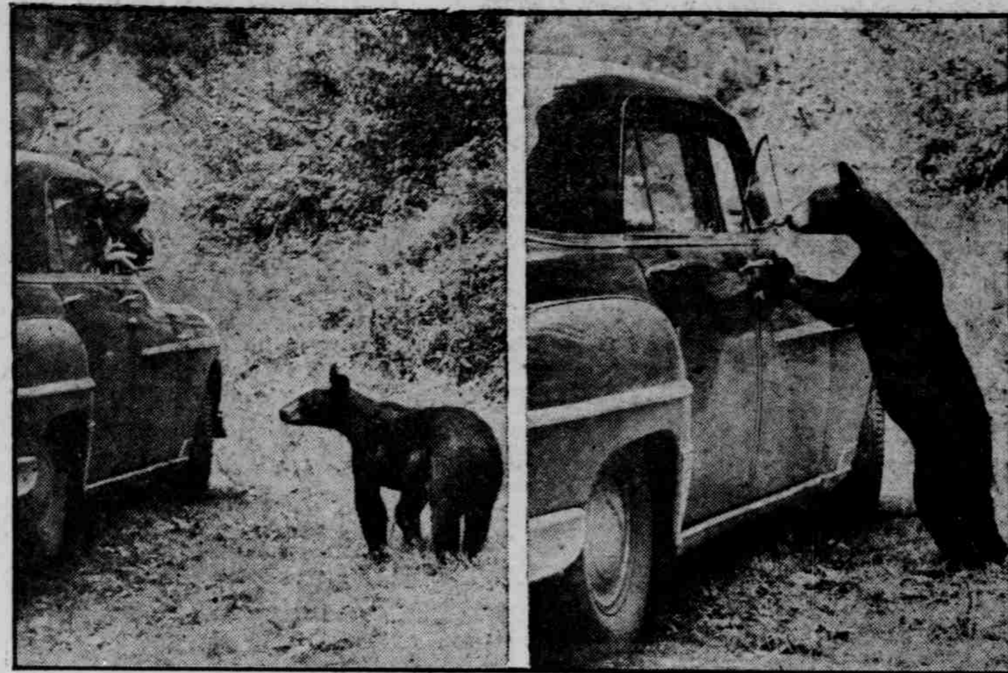
COULD'N'T BEAR IT —The camera-focusing tourist, left, was delighted to be able to take a moving picture of this black bear in the Great Smoky Mountains of North Carolina. But when the animal proved to be a ham at heart and moved in for a close-up, the lady ducked—as the empty car window at right shows.

A Classified Ad in The Journal costs as little as 35 cents