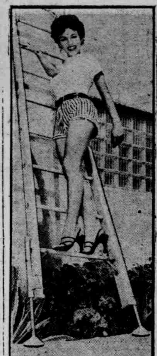
STEPS TOWARD SAFETY—Hollywood starlet Rita Moreno has no fear of the ladder slipping—thanks to a new gadget designed to prevent just that. The device consists of shoes and stabilizers attached to the feet of the ladder.

A Classified Ad in The Journal costs as little as 35 cents