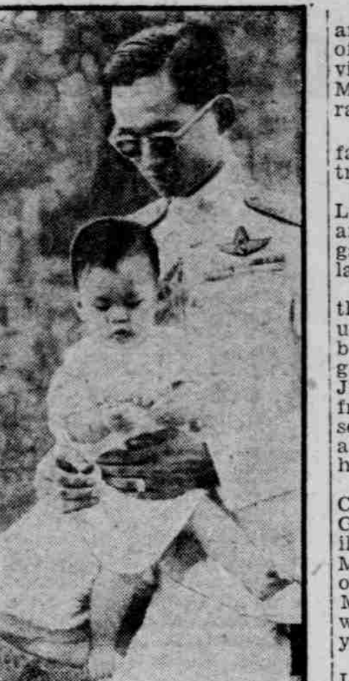
MUSICAL KING —Songwriter King Bhumpol Aduldet, of Thailand, is shown with his son, Prince Vajiralongkorn, heir apparent. The king was educated in the United States, and his music has been used in Broadway shows. The picture above was taken on the prince's first birthday.

REHABILITATION Community health and vocational groups must be ready to assume responsibility for rehabilitating the disabled when they are discharged from hospitals, according to Surgeon General of the U. S. Schools. Cass County's Greatest Newspaper — The Plattsmouth Journal