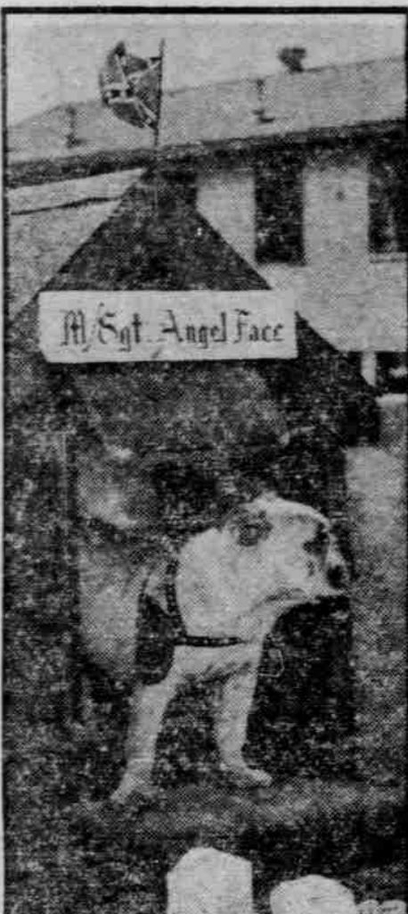
TOP DOG — "Master Sgt. Angel Face" steps outside his quarters at Ft. Hood, Tex., to take a look around. The "sergeant" was acquired by trainee members of "Dog" Company as a mascot and will become a member of the company.