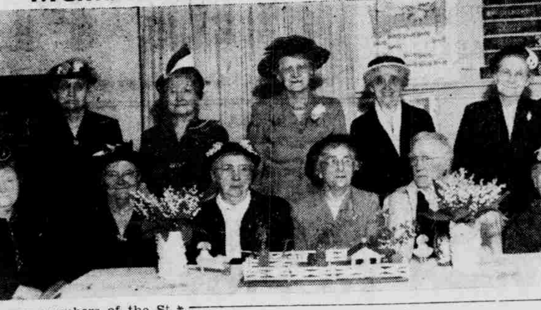
Honorary members of the St. Paul's Women's Guild were honored last Thursday, May 21, at a special entertainment in the church parlors. Eleven of the eighteen honorary members, those 70 years of age or older, were present.