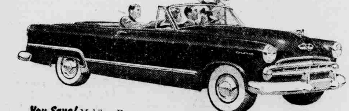
DODGE CORONET V-EIGHT CONVERTIBLE COUPE Price Reduced $201.80

You Save! Dodge prices have been lowered recently, all models... save you $60.60 to $201.80. You Save! Dodge gives you more comfort and safety... more extra-value features at no extra cost.