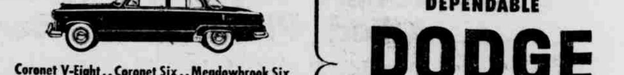
Coronet V-Eight... Coronet Six... Meadowbrook Six Prices start below many models in the "lowest priced" field

Get the New Lower Prices on These All-Time Family Favorites