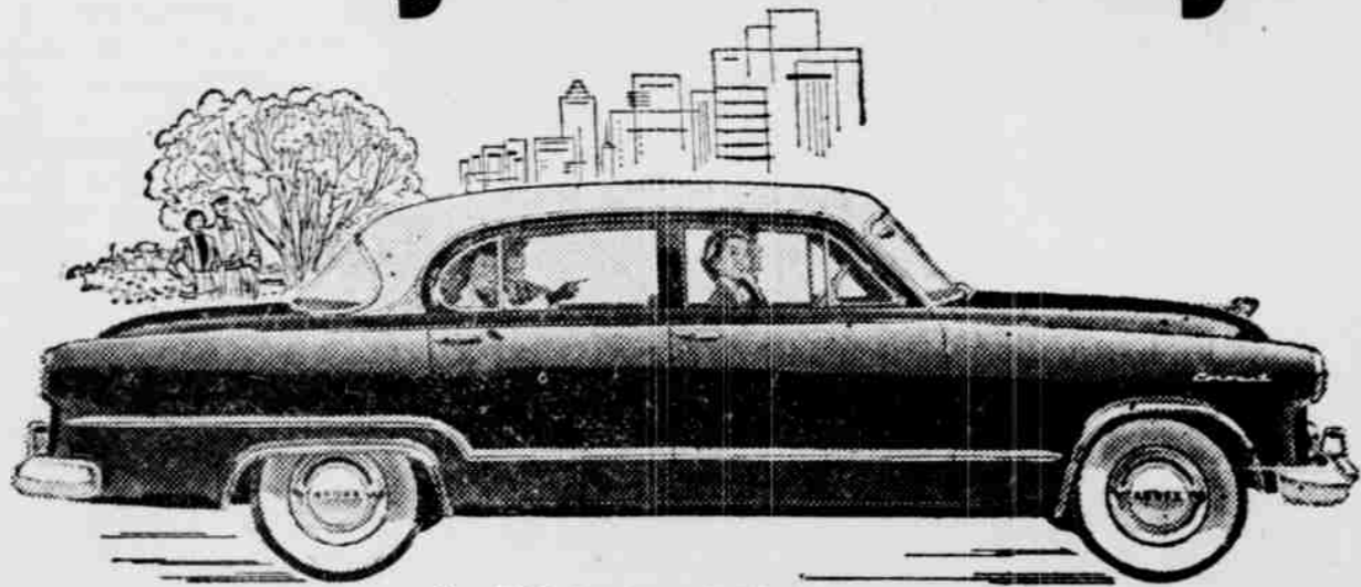
New '53 Dodge Coronet V-8 Four-Door Sedan

Compare what you get for what you pay. Discover that Dodge prices start below many models in the lowest-priced field. Size up the extra comfort, safety and style distinction Dodge offers. Step up to a solid, dependable Dodge. Step out in the smartest bargain on the road—the Mobilgas Economy Winner!