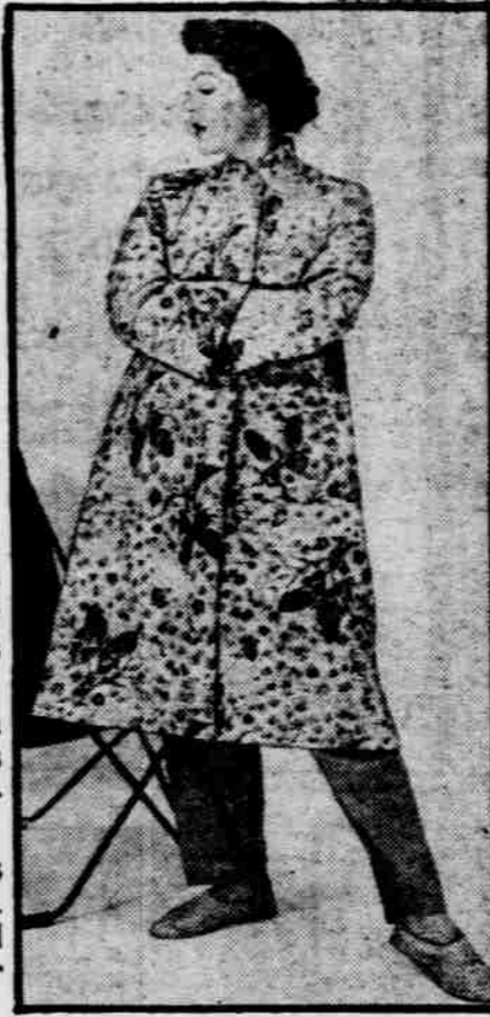
This three-quarter length mandarin coat in gold butterfly print is worn for leisure hours over aqua broadcloth pajamas. Both wash and iron beautifully.

Pajama top is in plaid with pants in solid color. Top and trousers can be worn outdoors as well as in; both are meticulously tailored. These three pieces are completely washable.