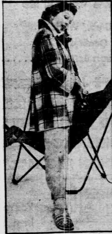
Designed for leisure wear, this three-piece ensemble is completely washable. Short, reversible plaid coat-tops trim two-piece pajamas.

THE trend to clothes designed especially for leisure hours at home is a noticeable one. It's a practical one, since the day of the elaborate tea gown and the flowing hostess gown has long since gone.