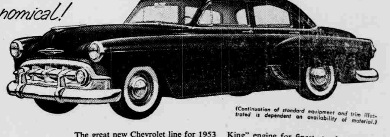
(Continuation of standard equipment and trim illustrated is dependent on availability of material.)

THE "ONE-FIFTY" SERIES lowest priced of all quality cars! Smart new Chevrolet styling and advanced features! Five models include the 4-Door and 2-Door Sedans, Club Coupe, Business Coupe, "One-Fifty" Handyman.