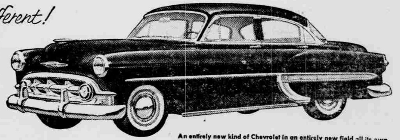
An entirely new kind of Chevrolet in an entirely new field all its own

THE BEL AIR SERIES to be compared only with higher-priced cars! The glamorous Bel Air Series for 1953 is truly a new kind of Chevrolet. Four new Bel Air models - 4-Door Sedan, 2-Door Sedan, Convertible, Sport Coupe - create a wonderful new class of cars.