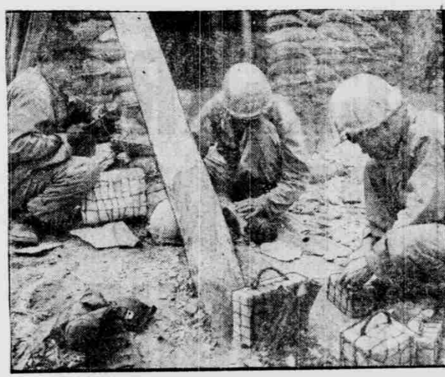
BUNDLES FOR HOME-BODIES —Front-line Thailand troops in Korea take time out from fighting to meet outside their fortified bunker and send packages back to the less fortunate folks on the home front. Presents include packs of chewing gum and cigarettes, bags of candy and soap which soldiers can obtain but which are scarce in Thailand.