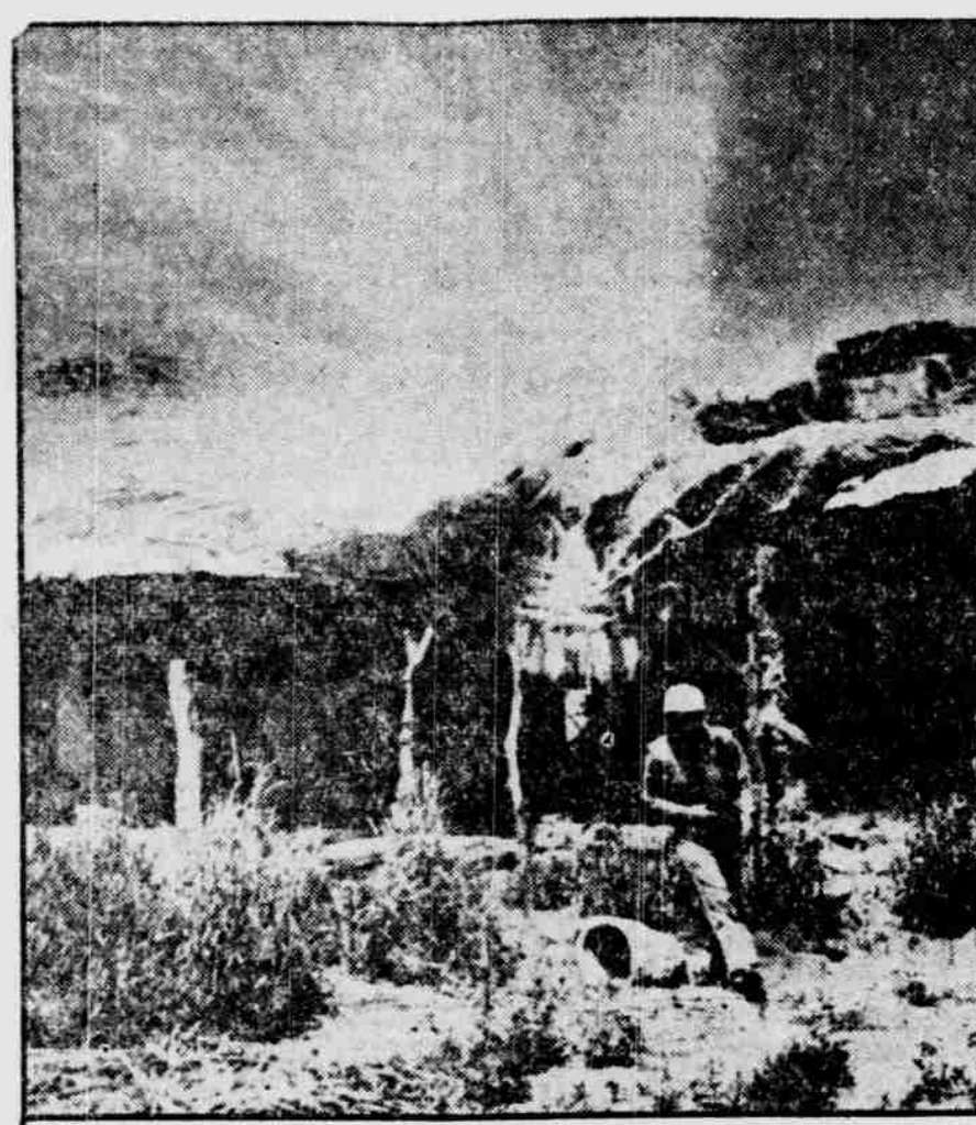
RAISING THE ROOF —Nonchalantly walking away from a hut in Korea, a Leatherneck of the First Marine Division doesn't even turn to see the damage wrought by the phosphorous grenade he has thrown. The hut was destroyed to prevent enemy snipers from using it.

Surface mining, which accounts for 25% of America's coal output, is known as "open cast mining" in England.