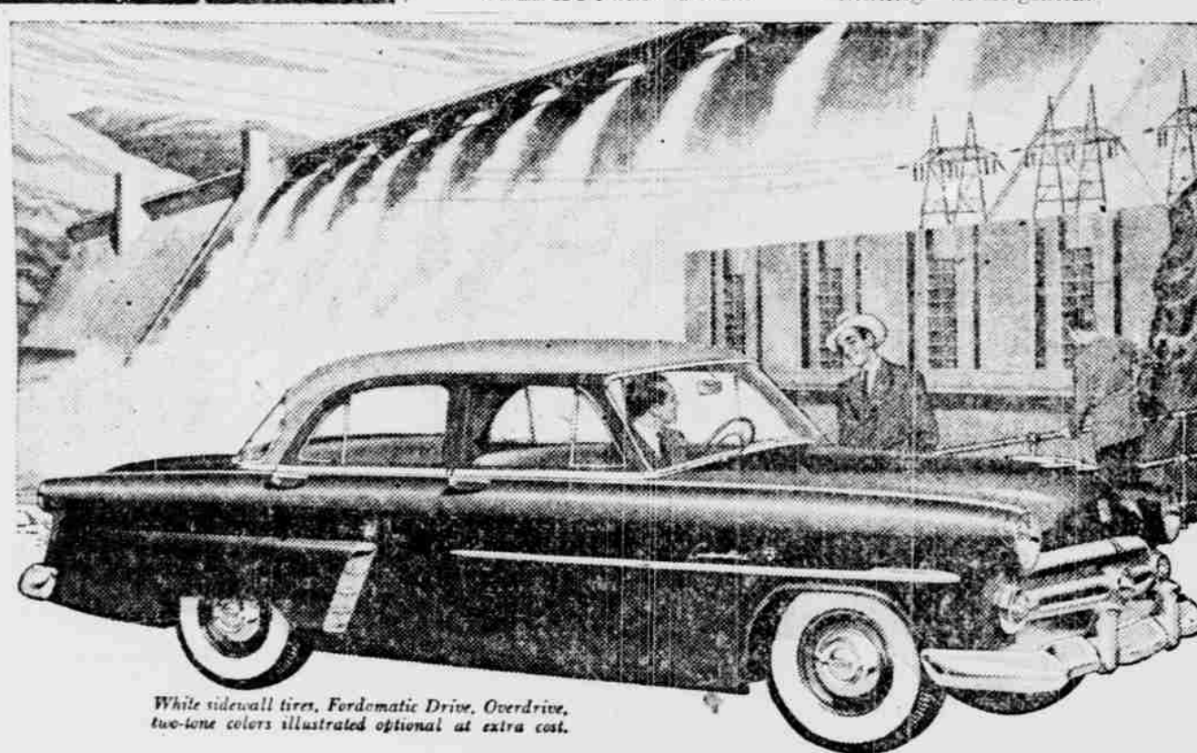
White sidewall tires, Fordomatic Drive, Overdrive, two-tone colors illustrated optional at extra cost.