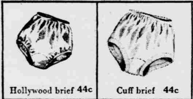
Hollywood brief 44c