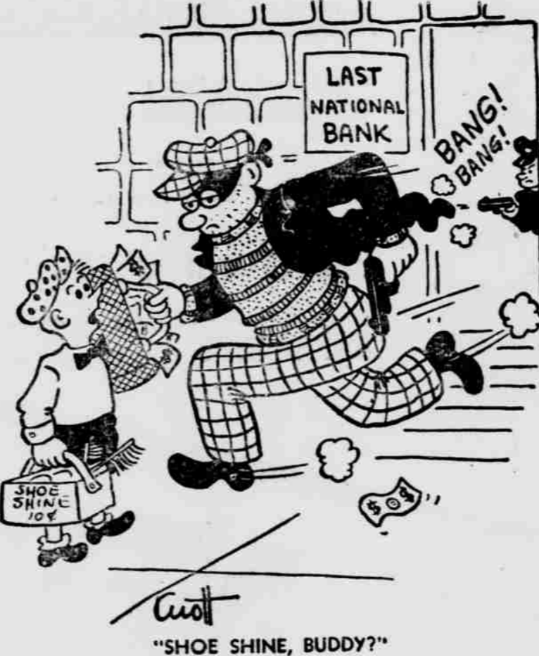
"SHOE SHINE, BUDDY?"

For full information contact your nearest VETERANS ADMINISTRATION office