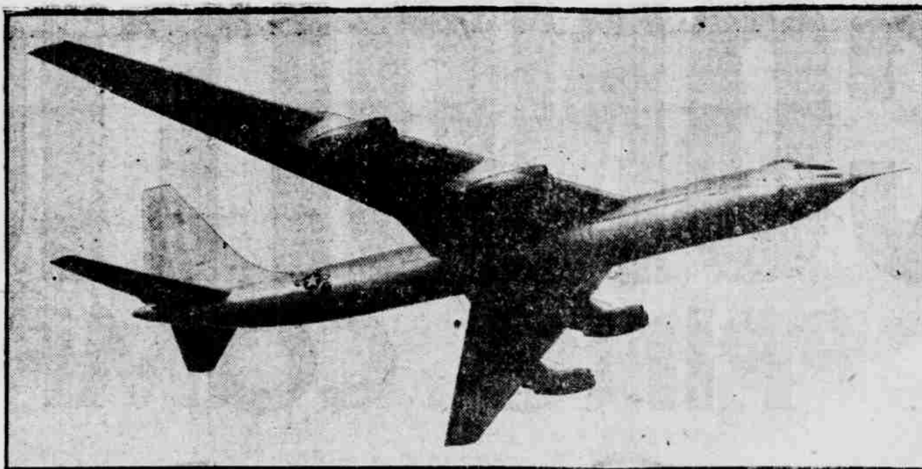
MAKES DEBUT FLIGHT —Powered by eight jet engines, the Consolidated Vultee YB-60 sweat-wing bomber thunders over Fort Worth, Tex., where it is undergoing flight tests. The new bomber flew for the first time April 18, but the U. S. Air Force authorized release of pictures only recently.